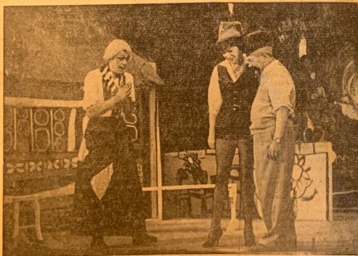
A scene from Act 1 of "Jack and the Beanstalk" currently staged by the Garrison Players at the Missions to Seamen. Left